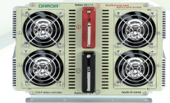
SI-5400AQ / SI-64024BQ / DP-95024BQ / SI-85048Q / DP-95048Q