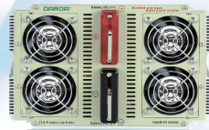
DP-44012AQ / DP-6000AQ DP-6000BQ / DP-70048Q