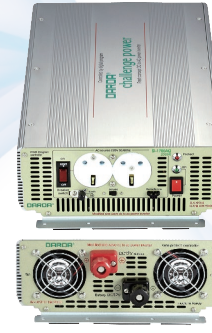
SI-1700AQ / SI-2200BQ DP-3000AQ / DP-3000BQ DP-40024BQ / DP-35048Q DP-40048Q