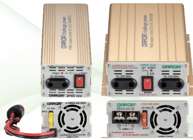
DP412 / DP424