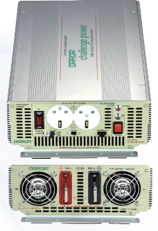
SI-22012AQ SI-2700AQ SI-32024BQ