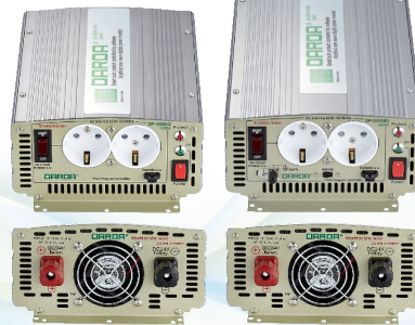
DP-1000AQ / DP-1500AQ DP-1000BQ / DP-16024BQ / DP-12048Q