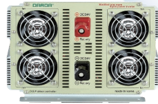
DP-50024BQ / DP-55048Q