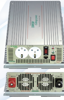
DP-2000AQ DP-25024BQ / DP-25048Q